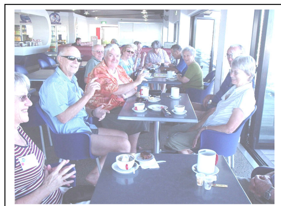
Recent morning tea happy group at Ninis.