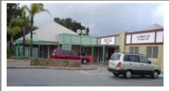
Mandurah Senior Citizens Center Home of Peel Seniorsnet.