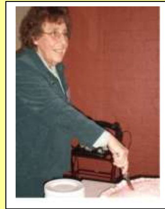
President cuts the cake

Tuesday September 8 th at 10am there will be morning tea at Sharky's ($4.50) Tuesday October 13 th 10 am morning tea at Pinjarra's Heritage Tearooms (5.50)