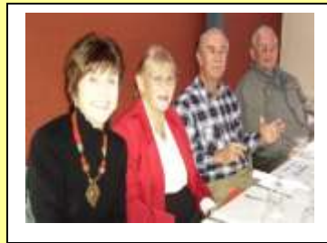
Some of our Members enjoying the birthday lunch.